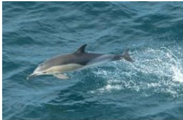
Common dolphin in the Bay of Biscay.

Researchers from the wildlife conservation charity Marinelife are extremely concerned about what it is NOT seeing this summer in the Bay of Biscay.