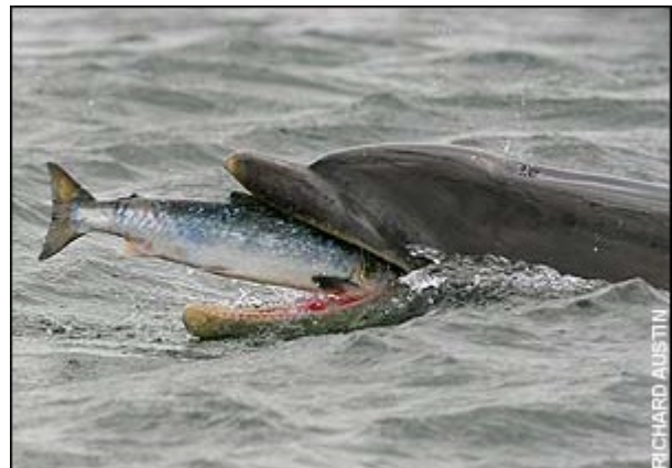
A dolphin catches one of the unlucky salmon

The salmon ( Salmo salar ) returning to the North Sea from the Atlantic hug the shore for safety and then as the tide turns use its force to carry them towards the rivers.